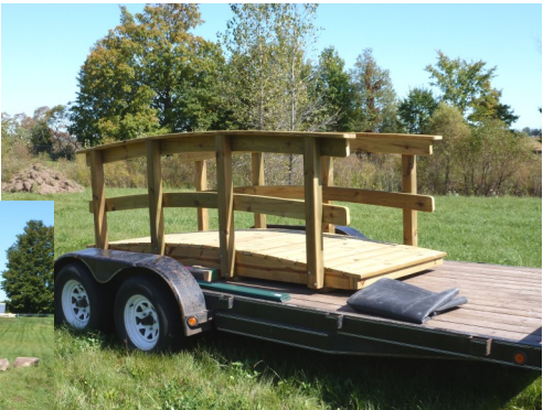
The bridge was made by the Enterprise program at Newaygo County Regional Educational Service Agency.