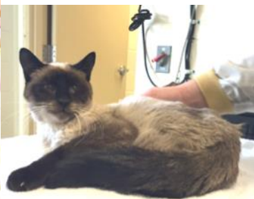
November 25, 2015