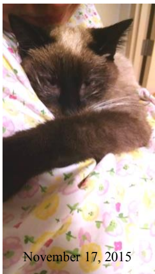
November 17, 2015