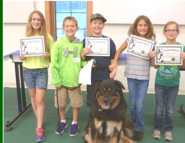
Pet Pals 2014

Pet Pals has been in educating children since 2006. WOW, that's 8 years! We went from one class to having 3 Pet Pals each summer helping kids grow. They get to experience what we do in the shelter and a small taste of volunteering. Some have come back as volunteers in high school.